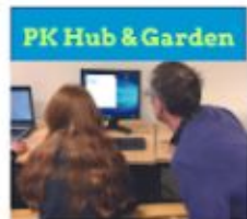
Therapeutic Gardening 1:1 & Group Sessions. Volunteers Needed